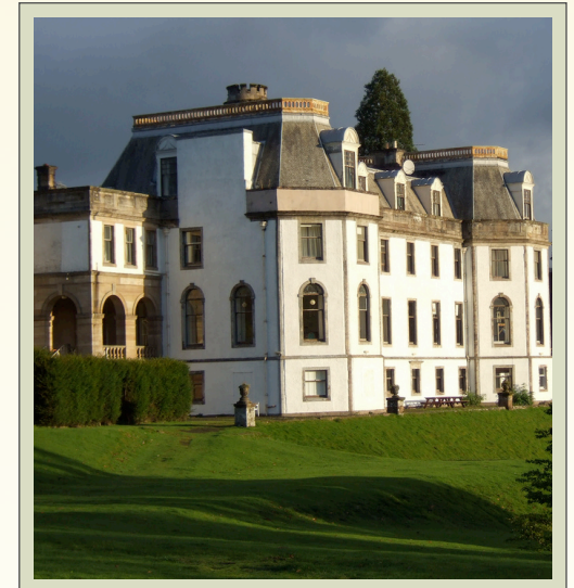
Gartmore House, Aberfoyle

July Week: Mon 11 th - Sat 16 th July 2011